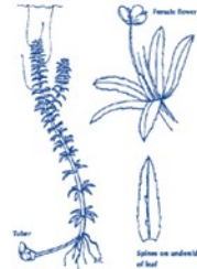
HYDRILLA ( Hydrilla verticillata ) 1