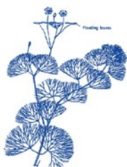
FANWORT ( Cabomba caroliniana ) 3