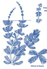
EURASIAN WATERMILFOIL ( Myriophyllum spicatum ) 1