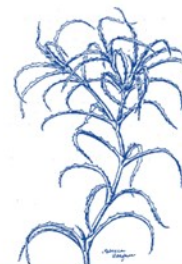
EUROPEAN NAIAD ( Najas minor ) 2