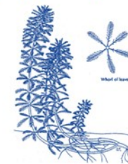
PARROT FEATHER ( Myriophyllum aquaticum ) 1