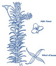
BRAZILIAN ELODEA ( Egeria densa ) 1