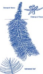
VARIABLE-LEAF WATERMILFOIL ( Myriophyllum heterophyllum ) 3