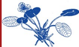
EUROPEAN FROGBIT ( Hydrocharis morsus-ranae ) 4 Free Floating Vegetation